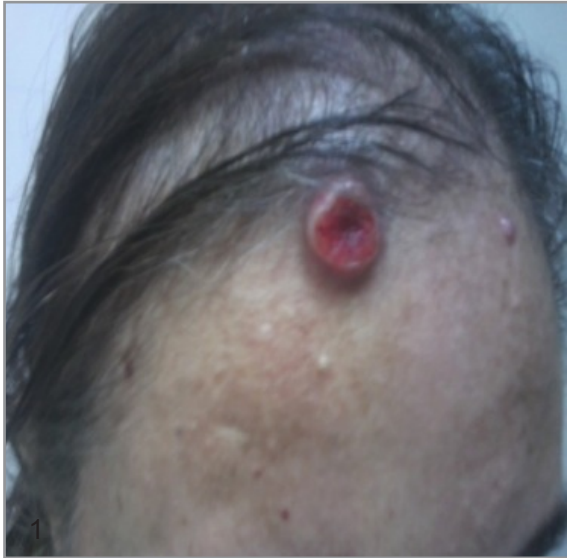
Figure 1. An ulcerated fragile skin metastasis on the forehead

Skin metastasis is reported as 5.3% and is more common in breast cancer with a predominance of thoracic localization. However, it is 4-5% in colorectal cancer and frequently localized on abdomen. Skin metastasis generally occurs in late terms with a poorer prognosis. 2,3 Our patient had skin metas-