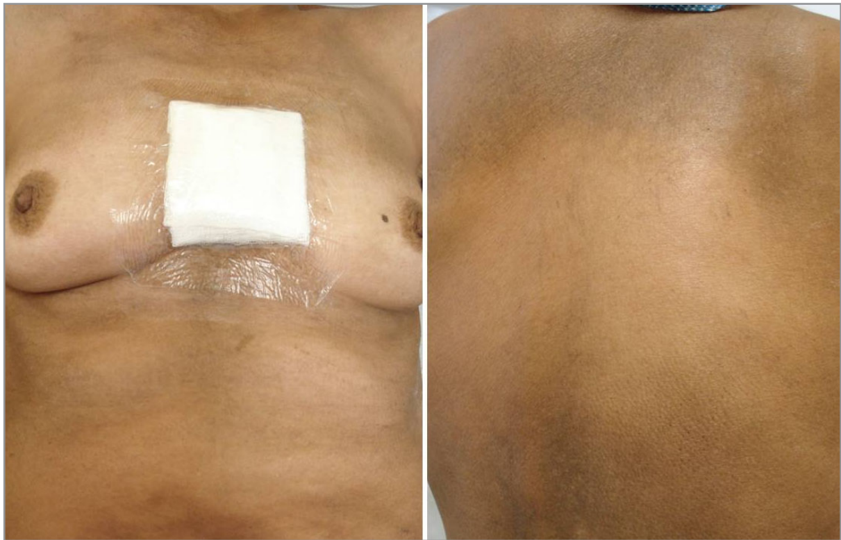
Figure 4. Resolution of the skin lesions after chemotherapy

the malignant hemopathies) 17 , non-Hodgkin's lymphoma, Kaposi's sarcoma, multiple myeloma, and carcinomas of breast, lung, ovary, and cervix. 3,11,18 Thus, new-onset ichthyosis at any age, should prompt further investigation due to associated internal disease. The ichthyosis usually occurs simultaneously with or after the diagnosis of the lymphoma but it can precede it in by one year or more. 19