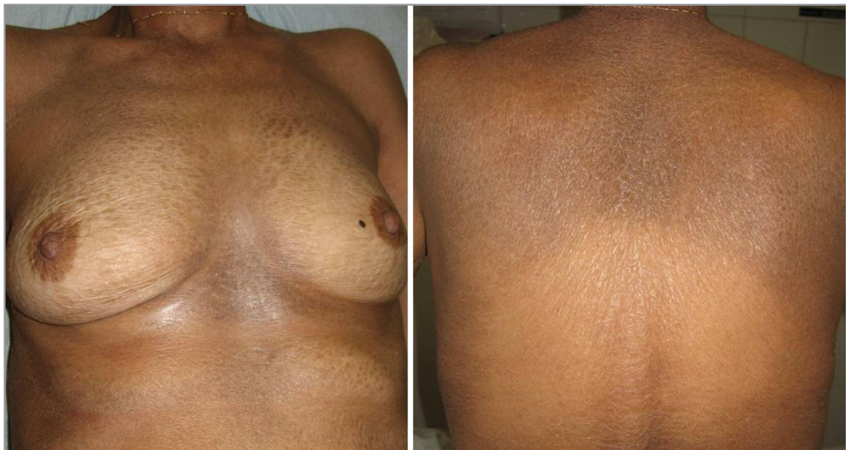
Figure 1. Diffuse scaling with a “dirty” appearance.

Computed tomography of the chest, abdomen, and pelvis revealed multiple mediastinal, mesenteric, iliac, and inguinal lymphadenopathies. An open inguinal lymph node biopsy was performed and the hematoxylin - eosin stain showed a neoplastic proliferation of Reed- Sternberg cells and a polymorphous cellular infiltration with eosinophils, neutrophils and plasma cells. Immunohistochemical staining was positive for CD30, CD15, and negative for LCA (leukocyte common antigen), CD3, and CD20. We diagnosed her as a mixed-cellularity Hodgkin’s lymphoma. Bone marrow biopsy showed hypoplasia with no other alterations. Serological tests for HIV, EBV, CMV, HBV, HCV, and tre-