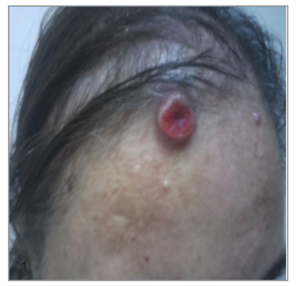
Figure 1. An ulcerated fragile skin metastasis on the forehead

Skin metastasis is reported as 5.3% and is more common in breast cancer with a predominance of thoracal localization. However, it is 4-5% in colorectal cancer and frequently localized on abdomen. Skin metastasis generally occurs in late terms with a poorer prognosis.<sup>2,3</sup> Our patient had skin metas-