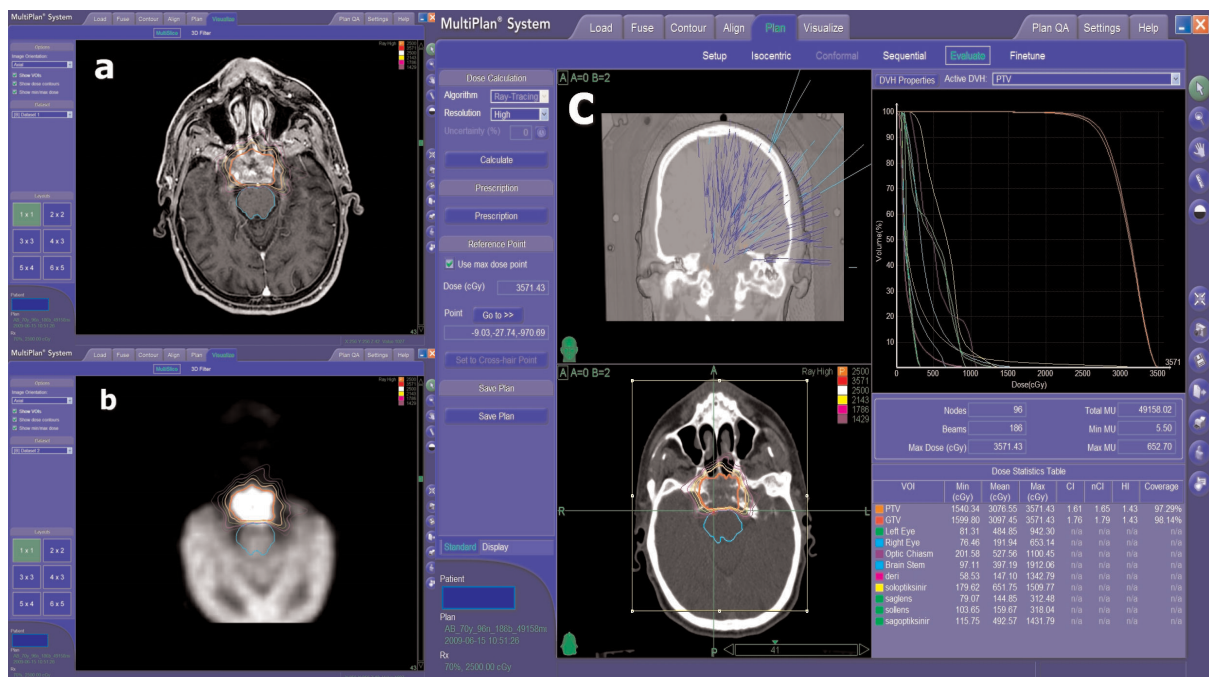
Figure 1. Planning image of recurrent NFC which is done by sequential method. Triple fusion. a) MRI. b) FDG-PET. c) Planning overview screen showing beam paths, DVH and isodose lines.

med in 5 to 6 fractions (median 5) which was completed in 5 to 9 days (median 7). Because, almost all patients were treated with 2D techniques previously, doses of first radiation to the critical organs were not known exactly. So, critical organ doses of FSRT were tried to keep as low as possible. Critical organ doses are listed in Table 3.