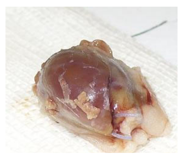
Figure 4A. Fibrotic, adherence to the adjacent tissue in conventional suture group

Peroperative findings: Hemostasis was attained intraoperatively in all control and experimental animals. All ABS experimental animals received completely sutureless renal treatment. The blood loss could not being evaluated objectively due to the small kidney size and resected tissue. There were no significant intraoperative complications. Mean RT and time to hemostasis was 3.7 (2.2-4.2) minute, 3.2 (2.8-3.6) minute. in GI, GII respectively with no difference was detected (p> 0.05). Mean number of ABS gout was 6.0 (5-8) in GII. In ABS group, the formation of aggregate (protein