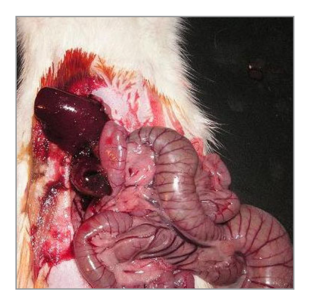
Figure 3. Ankaferd induced protein network, macroscopic view

Peroperative findings: Hemostasis was attained intraoperatively in all control and experimental animals. All ABS experimental animals received completely sutureless renal treatment. The blood loss could not being evaluated objectively due to the small kidney size and resected tissue. There were no significant intraoperative complications. Mean RT and time to hemostasis was 3.7 (2.2-4.2) minute, 3.2 (2.8-3.6) minute. in GI, GII respectively with no difference was detected (p> 0.05). Mean number of ABS gout was 6.0 (5-8) in GII. In ABS group, the formation of aggregate (protein